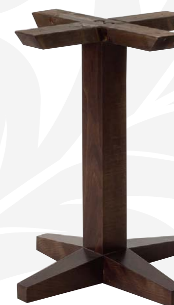
Base in legno di faggio

Alternative: sono disponibili vari modelli e varie misure