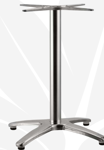
Base acciaio inox