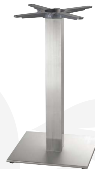
Base acciaio inox satinato