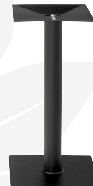
Base ghisa verniciata col. nero