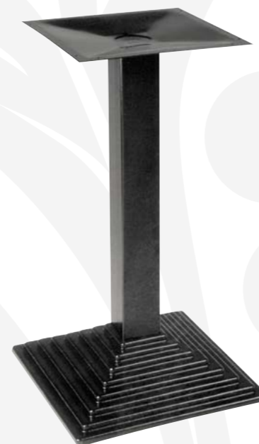
Base ghisa verniciata col. nero