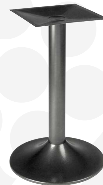
Base ghisa verniciata col. nero